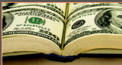
Financing the Future