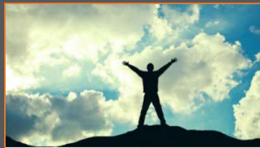
Pursuit of Passion

*Please share an electronic copy with all GT parents/guardians and link the form in Schoology for student access.