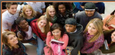
My Own Mixtape: Analyzing the Role of Self and Society